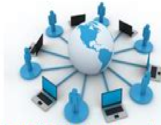
(WAN) Wide Area Network