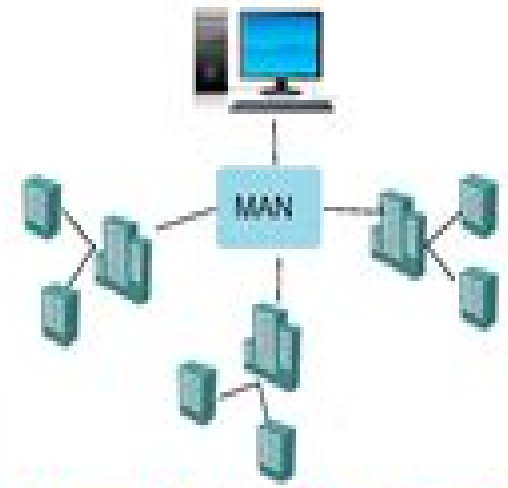
Metropolitan Area Network