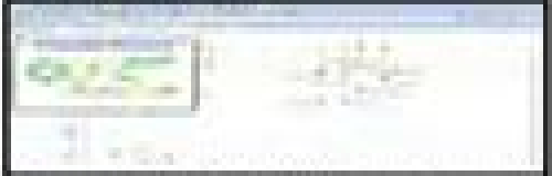
Figure 2. An ACD/LABS CASE software panel displaying the fragmentation pathway of an unknown compound, overlaid with MS/MS data. Clarity, consistency, and software flexibility contribute to improved spectra and structure, highlighting those which are likely to be accurate.

For more information, contact ACD/LABS at info@labs.com or www.acdlabs.com . ACD/LABS is a registered trademark of ACD/LABS Software Inc. All rights reserved. © 2005 ACD/LABS Software Inc.