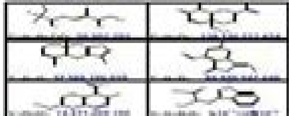
Figure 1. The large number of possible isomers for some relatively small organic molecules.

Computer-assisted structure elucidation (CASE) has been used to help identify compounds isolated by the detection of novel or difficult structural isomers, especially those of unusual products of drug metabolism and synthesis. The completely automatic structure determination, even from the smallest of samples, has now become a reality. Systems like ACD/LABS are designed to do this reliably and quickly.