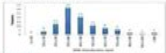
Figure 5. The number of molecules versus molecular weight for challenge substances to ACD/LABS.

Between 2000 and 2001, 112 different substances were submitted from various industries as challenges to the ACD/LABS Chemical Structure Suite system. (2) The structures submitted ranged from 100 to 1000 atoms, with the largest of all the submitted test samples having approximately 1000 atoms (Figure 5).