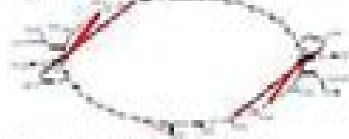
Figure 7. The successful structure of hexadecyl stearate.

In one recent example, Molecular Structure Suite was able to determine the structure of a large, symmetrical ester based on MS/MS data, covering 90 structural units, even with the presence of unknowns (Figure 7).