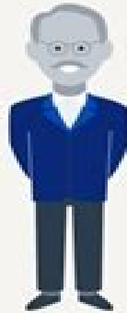
Baby Boomers Born: 1946-1964