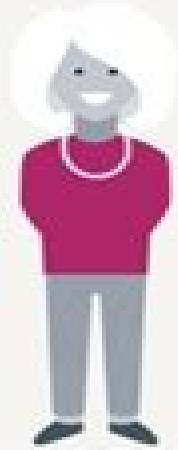
Builders Born: < 1946