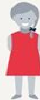
Gen Alpha Born: 2010-2024