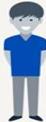
Gen Z Born: 1995-2009