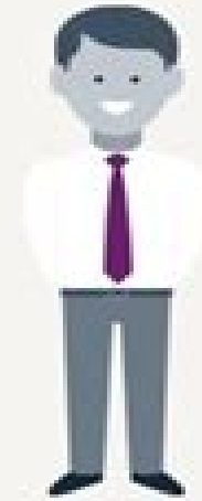
Gen X Born: 1965-1979