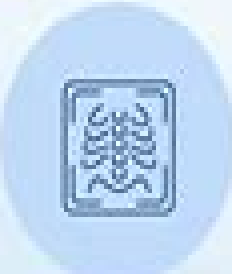
Electronic Health Records (EHR)