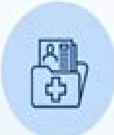
Electronic Medical Records (EMR)