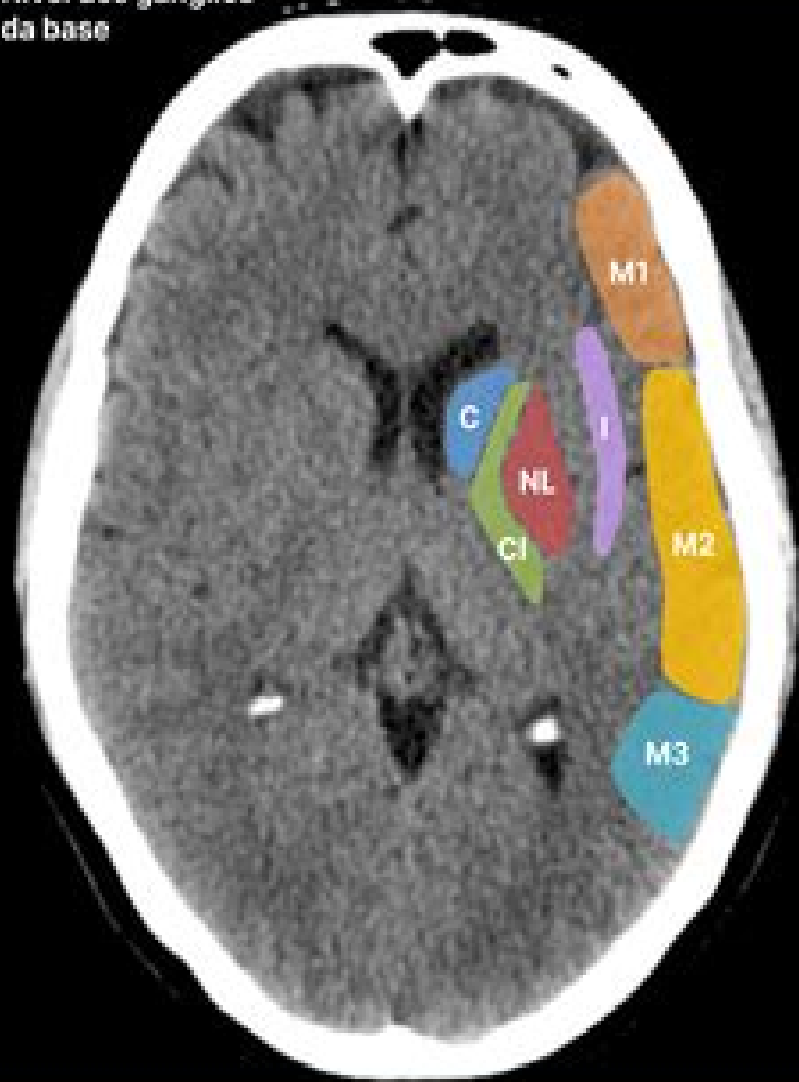
Nível dos gânglios da base