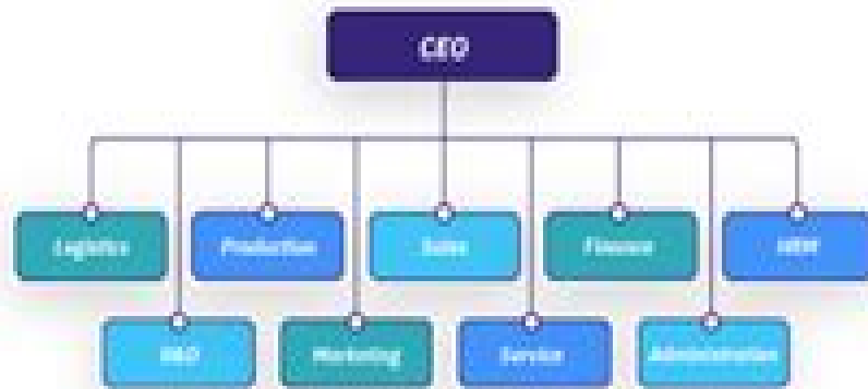
1. Functional Organizational Design