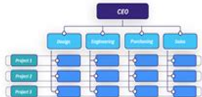
4. Matrix Organization