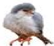
African Pygmy Falcon