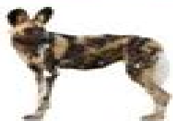
African Wild Dog