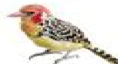
Red and Yellow Barbet