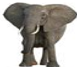
African Bush Elephant