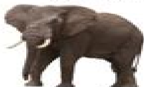
African Savanna Elephant