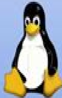
Linux: Debian GNU/ Ubuntu, etc.