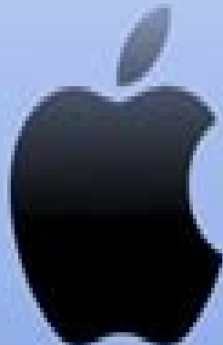
Mac OS and IOS By Apple