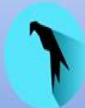
Parrot Security OS