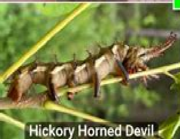
Hickory Horned Devil