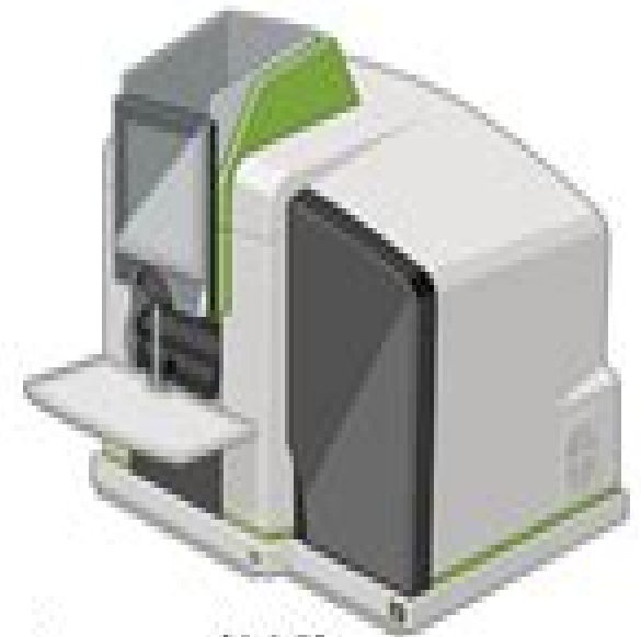
Atomic Absorption Spectroscopy (AAS)