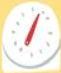
Work on managing time