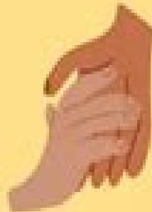
Ask for support