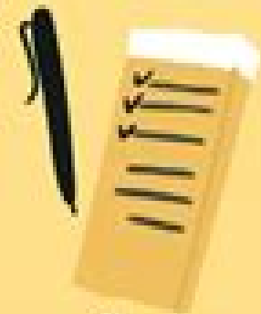
Create a to-do list