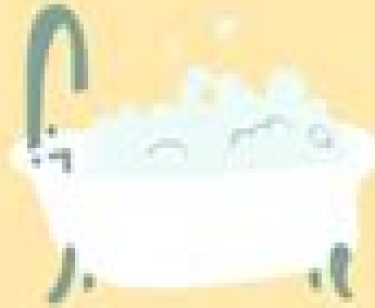
Take a bath