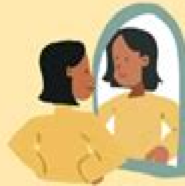
Give yourself a pep talk