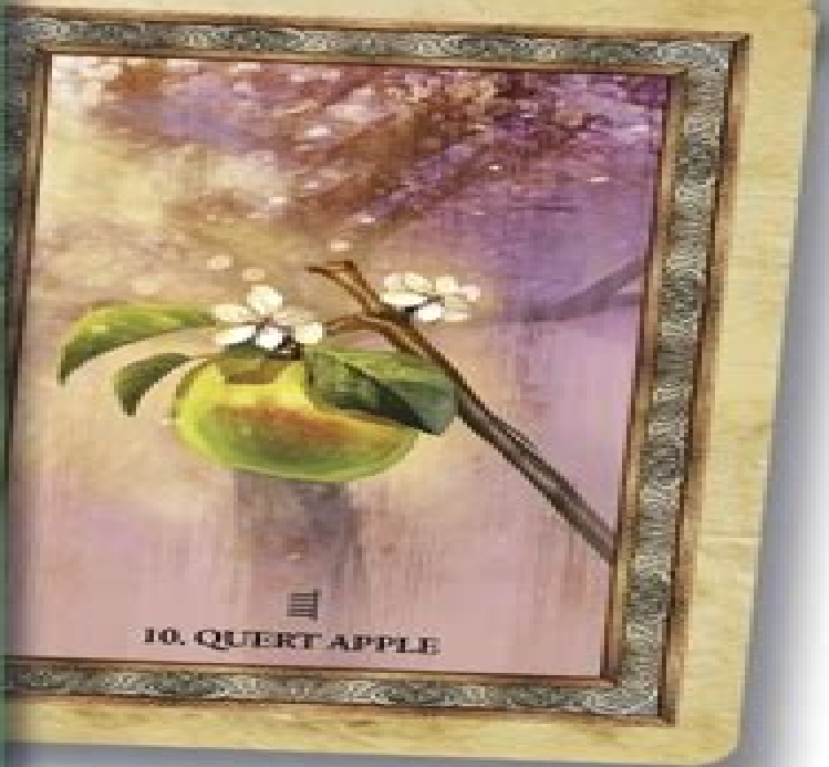
10. QUERT APPLE