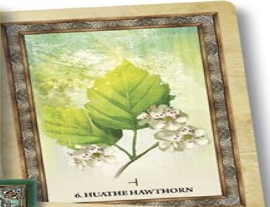
6. HUATHE HAWTHORN