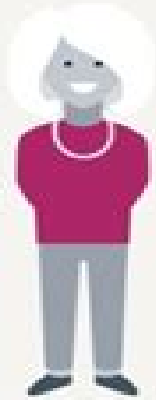
Builders Born: < 1946