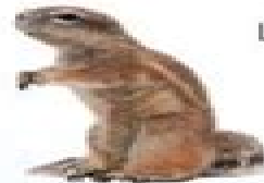
Arctic Ground Squirrel