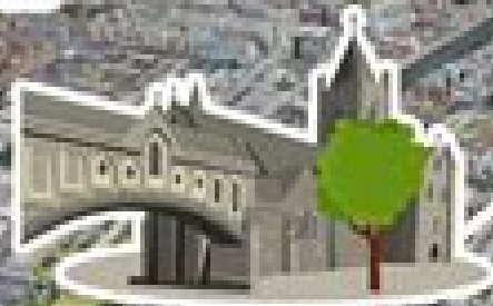
Christ Church Cathedral