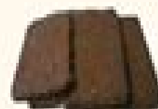
Pumpernickel (Rye bread)