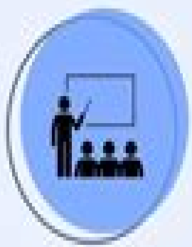
Classroom- Based Training