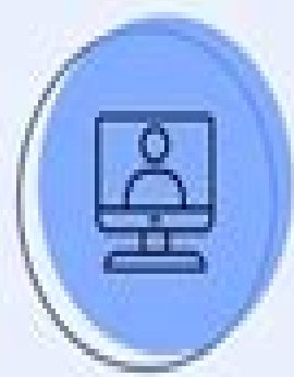
Virtual Instructor- Led Training (VILT)