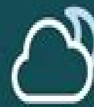
Partly cloudy at night