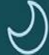
Clear sky at night