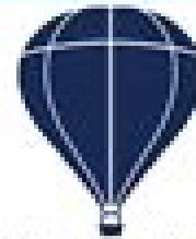
Hot Air Balloon