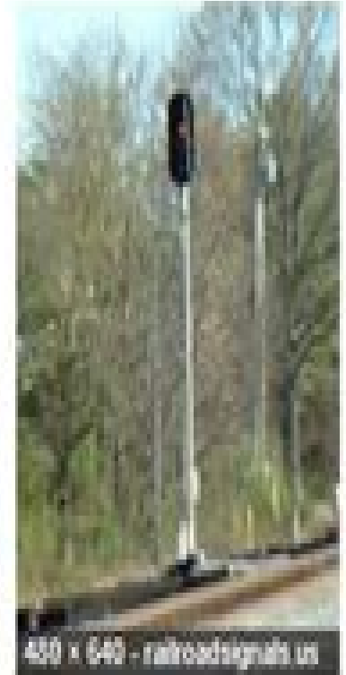
400 x 640