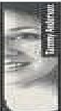
Conversations with the Dead