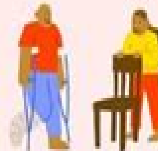
7. Using manners