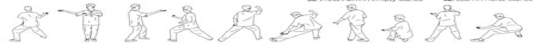
32. Lean in Horse Stance