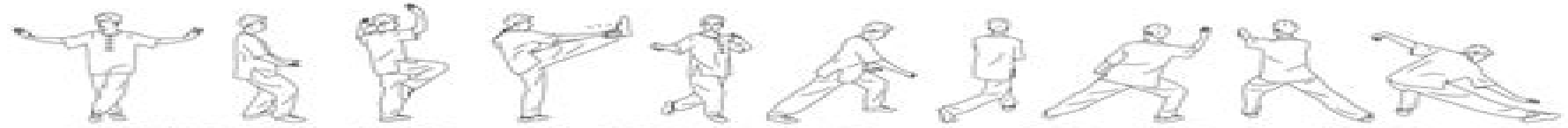
24. Turn Body and Slap Foot