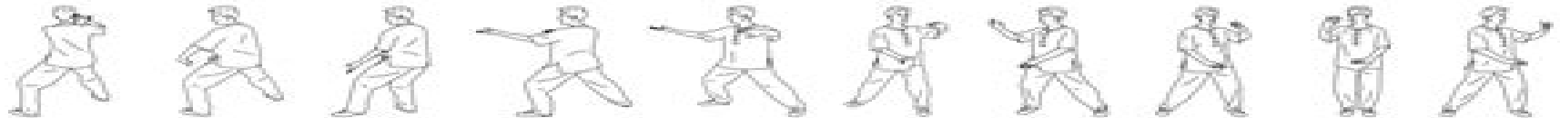
18. Part the Wild Horse's Mane