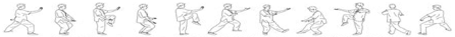
28. Golden Rooster Stands on One Leg