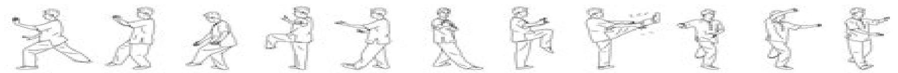
36. Step Up Seven Stars