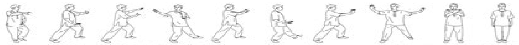
40. Left Grasp the Bird's Tail (ward off, rollback, press, push)