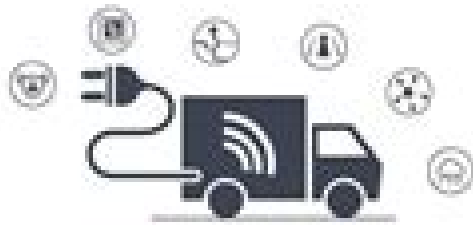
Conncted car technology