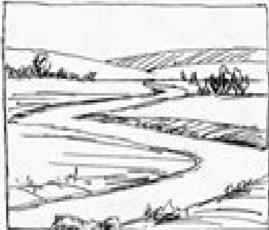
"S" or Compound Curve.