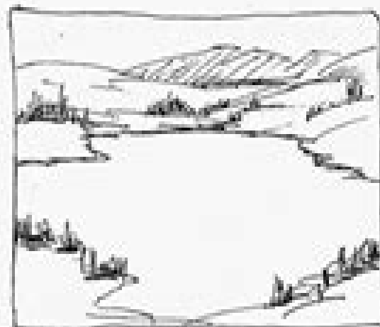
"O" or Circular