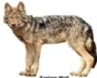
Eastern Wolf Canis lycaon , 82