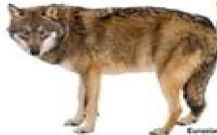
European Wolf Canis lupus lupus , 84