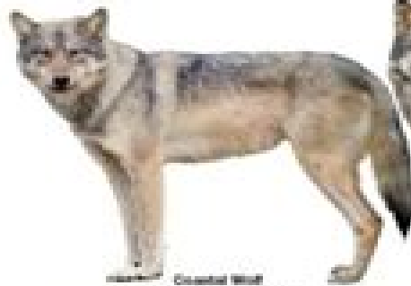
Coastal Wolf Canis lupus ssp. , 83