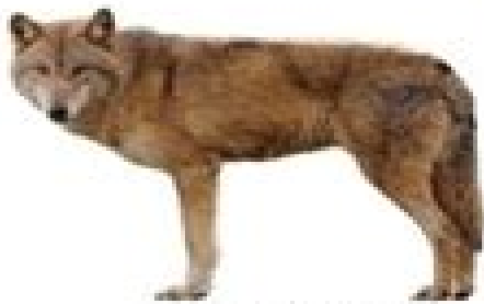
Tibetan and Himalayan Wolf Canis lupus chancoi , 102