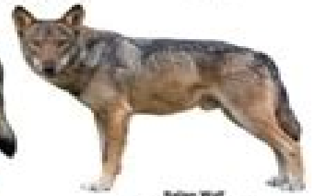
Italian Wolf Canis lupus italicus , 100