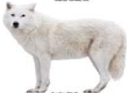
Arctic Wolf Canis lupus arctos , 84