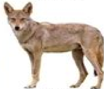
Fennian and Indian Wolf Canis lupus pallipes , 104