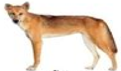
Dingo Canis lupus dingo , 108