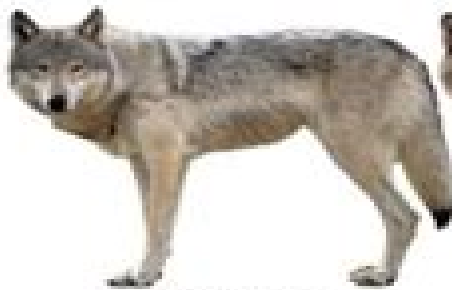
Northwestern Wolf Canis lupus occidentalis , 86