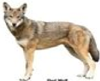
Red Wolf Canis rufus , 80