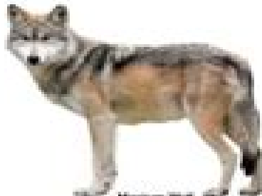
Mexican Wolf Canis lupus baileyi , 85