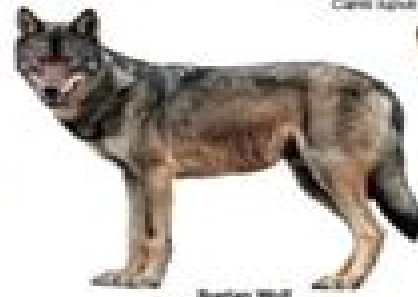
Balkan Wolf Canis lupus sylvaticus , 86