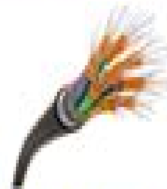
Fiber Optic Cables