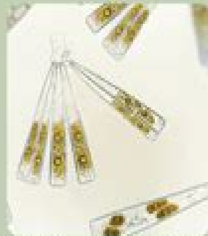
Golden Algae (Chrysophyceae)