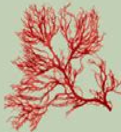
Red Algae (Rhodophyta)