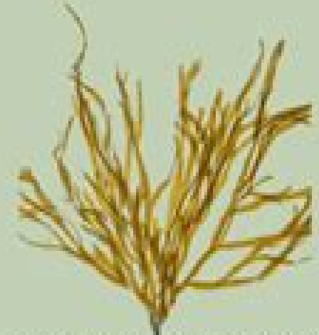
Brown Algae (Phaeophyceae)