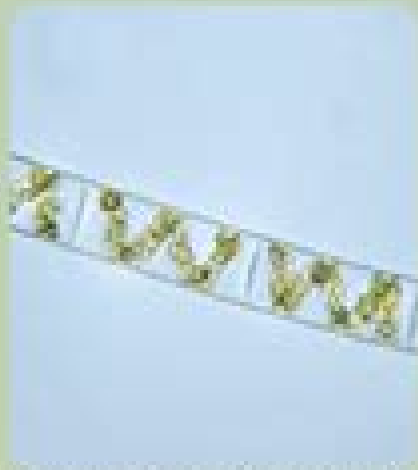
Green Algae (Chlorophyta)

Algae are a diverse group of photosynthetic, primarily aquatic organisms.