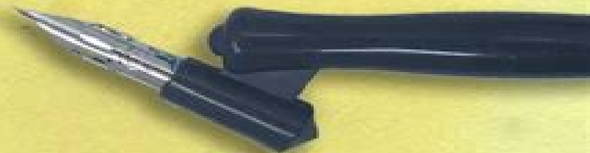
Pointed pen in Script