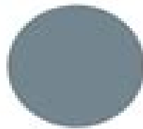
Behr Adirondack Blue