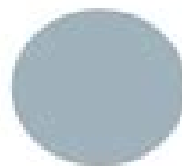
Sherwin-Williams Dockside Blue