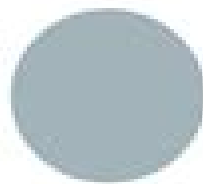
Benjamin Moore Santorini Blue