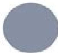
Benjamin Moore Flower Box