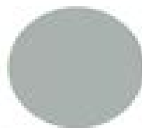
Benjamin Moore Boothbay Gray