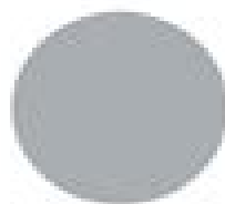
Sherwin-Williams Morning Fog