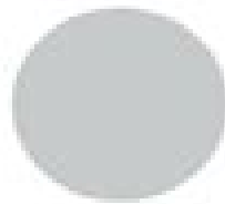
Sherwin-Williams Gray Screen