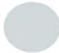
Benjamin Moore Blue Lace