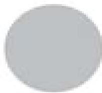
Sherwin-Williams Lazy Gray