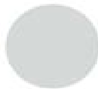
Sherwin-Williams Olympus White