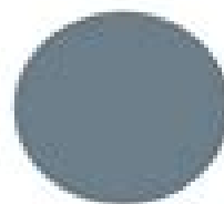
Benjamin Moore Normandy