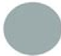
Valspar Blue Arrow