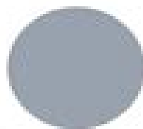
Benjamin Moore Comet