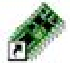
BASIC Stamp Editor

← Icon to Start BASIC Stamp Development System