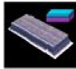
Cyan/Magenta Ceramic Structure