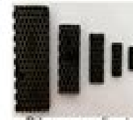
Bilayer-gradient Honeycomb Structural Absorber